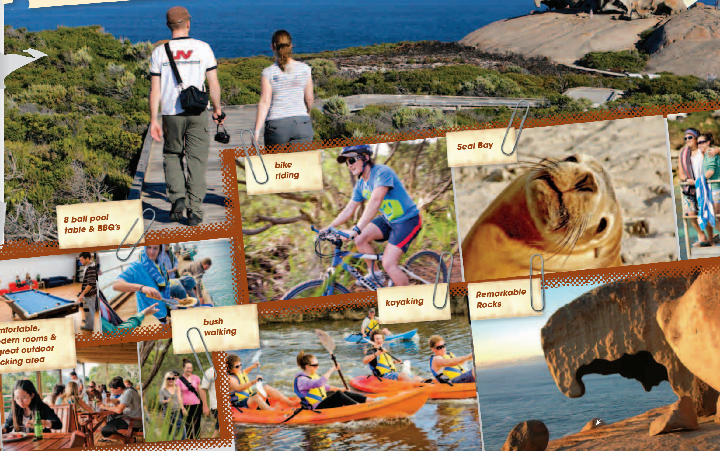
8 ball pool table & BBQ's

Stay at Vivonne Bay Lodge set on 206 hectares of natural Australian bushland with 1km of beach frontage. There's a range of indoor and outdoor activities including table tennis, 8 ball, cycling, kayaking, bush walking and swimming at nearby Vivonne Bay beach. Enjoy a delicious Aussie BBQ on the large outdoor deck area, and say hello to the resident kangaroos that frequently hop in to visit the guests!